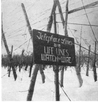
The 3d Signal Company posted similar signs throughout the area to aid the campaign to keep in communications.

298 killed, 327 prisoners, and an estimated 1185 wounded. In addition the enemy lost four tanks, twelve mortars, two Flakwagons, forty machine guns, and a large number of artillery pieces.